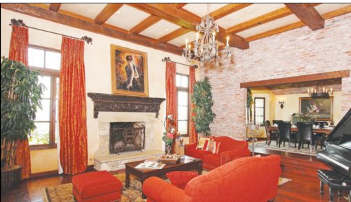
Left: Reclaimed beams and a handcrafted fireplace/mantel are just two of the custom features that distinguish the home’s living room.