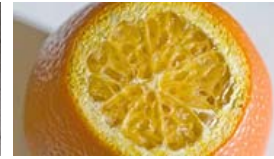
Market Watch: When citrus is past its prime