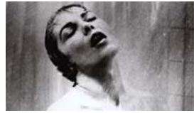
Book review: 'The Girl in Alfred Hitchcock's Shower'