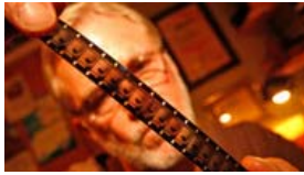
Digging up a piece of Hollywood history