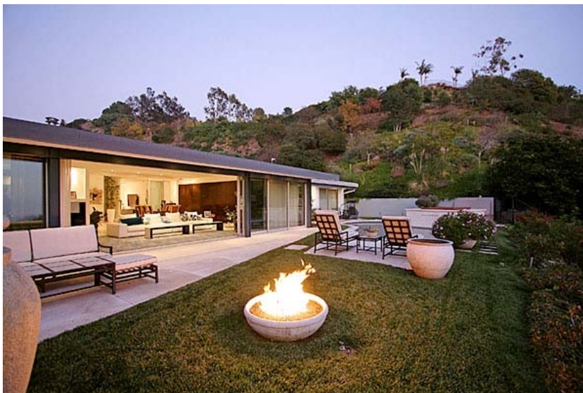
In addition to a keyhole-shaped pool and spa, the tapered backyard has a small lawn, limestone patios and a landscaped garden that drops off steeply to the property below.

This 1959 Trousdale Estates house has been owned by celebrities including singer-actress Lauryn Hill and radio personality Tom Joyner.