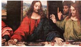
Last Supper study shows helpings have grown